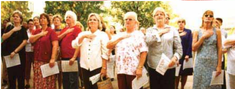
Those assembled join with gusto in the Pledge of Allegiance.