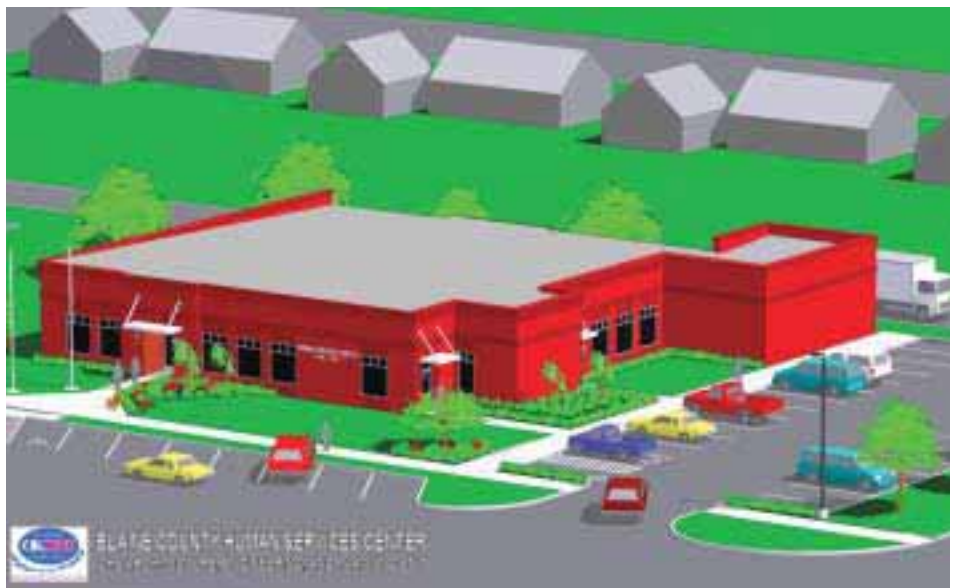
Architecture and Engineering Unit’s rendering of the new county office.

interior will bring the Blaine County staff into the 21st Century, the exterior will be purposefully stuck in the late 19th Century. “The exterior building design is characteristic of the turn of the century masonry craftsmanship with corbel brick cornices and large glass windows,” said Tur. “The design was developed in